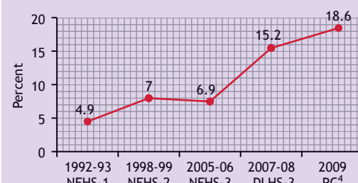
Figure 1: Trend in early breastfeeding in rural UP

Status: The Population Council study reveals that 19 percent of women initiated breastfeeding within one hour of birth of their child. The practice of early breastfeeding has been slowly increasing from 1992-93 to 2009 (Figure 1).